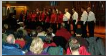
The Conservatory Pops Choir at the concert

Sounds of the season filled Young United Church on December 10, 2006 as MCMA students performed in the annual holiday concert. With performances ranging from classical and holiday standards, to pop, jazz and Celtic music, there was something for everyone.