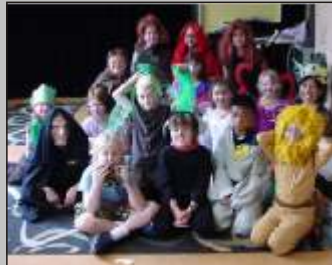
Campers in last year's Songs & Scenes camp prepare to put on a show

Kids age 7 to 12 can choose from four different week-long day camps, each with a different theme. Using the acclaimed Orff method, this year's music- based camp themes include Folk Music (July 9-13), Songs & Scenes (July 16-20), Myths & Legends (July 23-27) and Around The World in 5 Days (July 30-August 3).